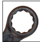
3/4" or 1" square ratchet head