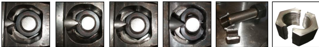
Sequence of photographs showing a typical nut splitting operation. In most cases it is necessary to split the nut on two opposite faces.

Please contact us for further specification details and advice.