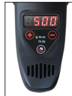
Easy to use digital display