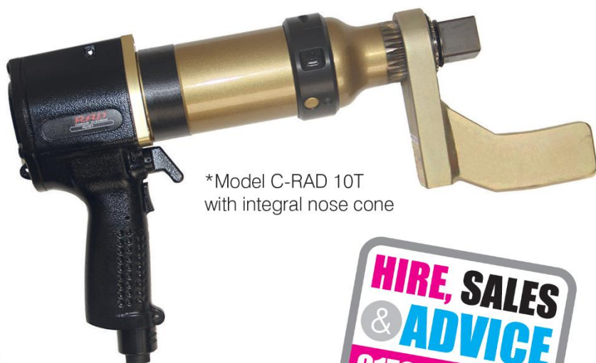
*Model C-RAD 10T with integral nose cone

See table below for dimensions and detail