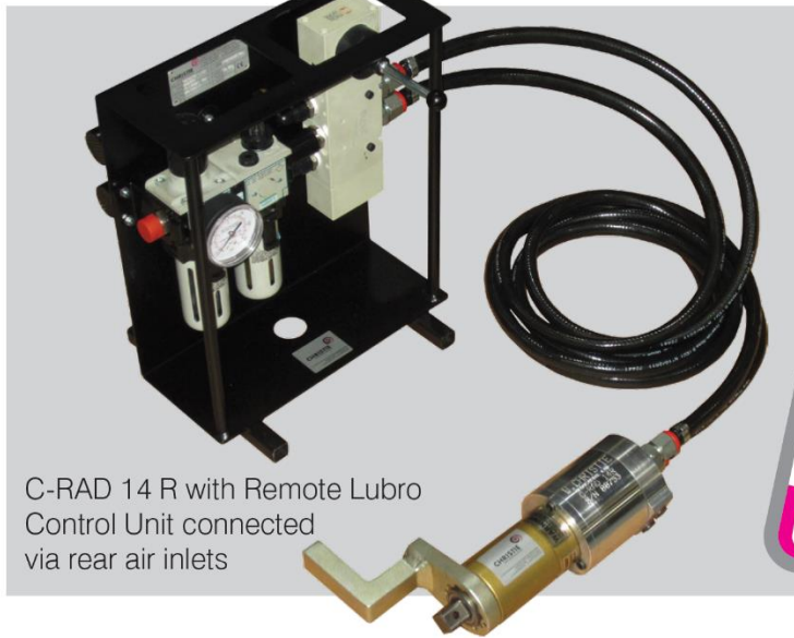
C-RAD 14 R with Remote Lubro Control Unit connected via rear air inlets