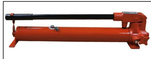
Manually operated pump unit (steel construction) for use with Hydraulic Nut Splitters

Whilst every effort has been made to ensure the availability of the models and specifications within this catalogue, our policy of continuous improvement means specifications and models are liable to change without notice. We reserve the right to change the specifications and models available for sale or hire and to supply equivalent products where appropriate.