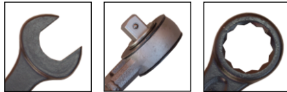
Open End 3/4" or 1" square ratchet head Ring End